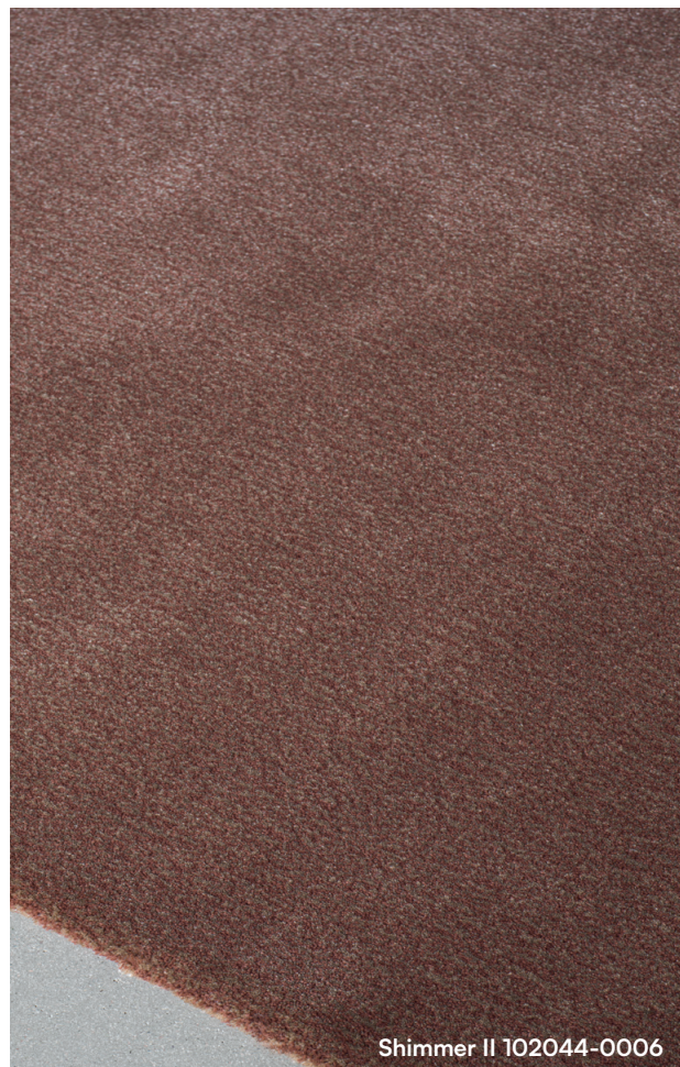
Shimmer II 102044-0006