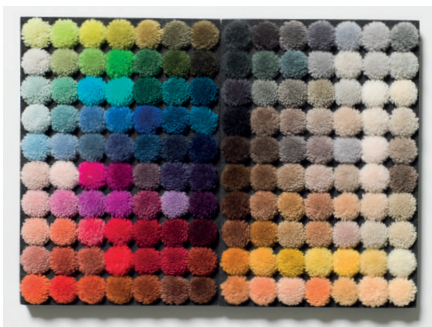
Wool Spirit palette 140 colours

If our standard colours don't match your vision, create a custom combination to suit your design.