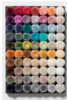
Tencel palette 70 colours