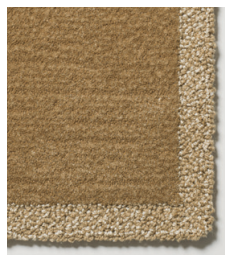
102044 Cut 10 mm